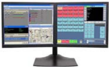
Role Player – E911 Caller