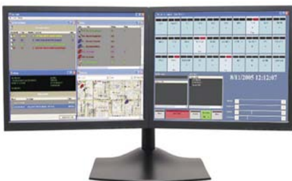
Role Player – Radio

Four configurations available: Administrative Advanced Intermediate Basic