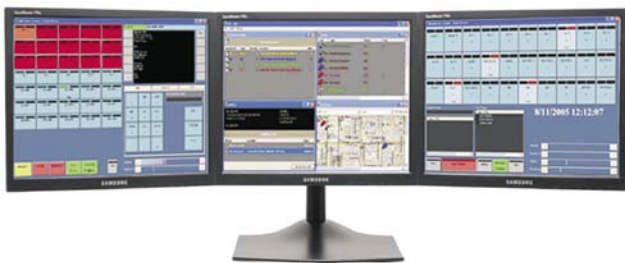
Student Call Taker/Dispatcher